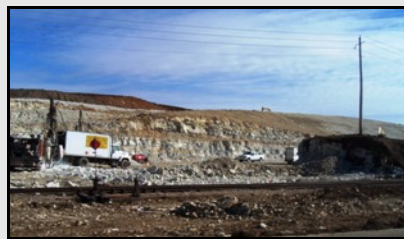
P&A Drywall moving earth