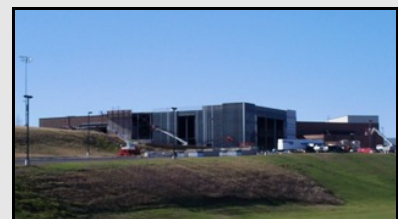
Union High School gymnasium addition on target