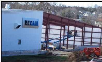
Rexam Expansion well under way